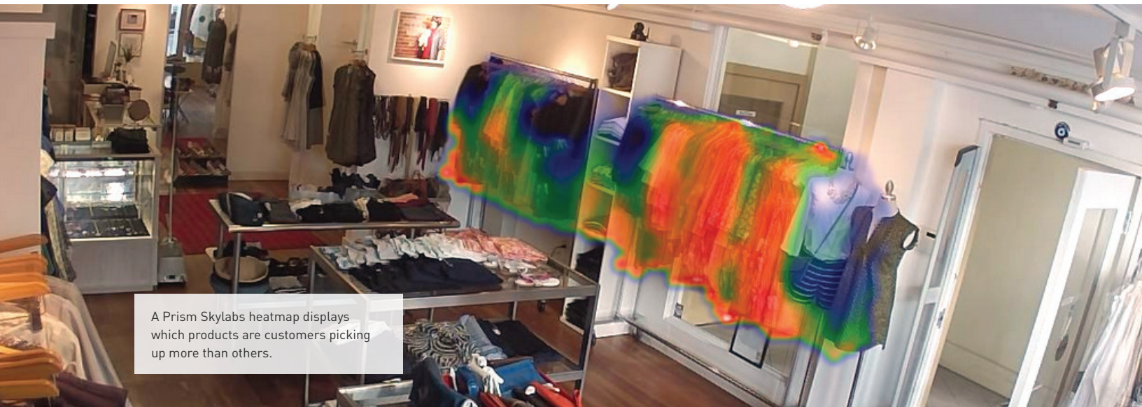
A Prism Skylabs heatmap displays which products are customers picking up more than others.